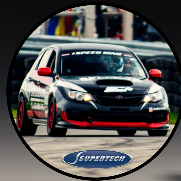
1ST PLACE STREET JOSHUA & THOMAS HALKA - 1:13.486