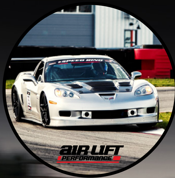
1ST PLACE TRACK MODIFIED ERIC FLEMING - 1:09.072