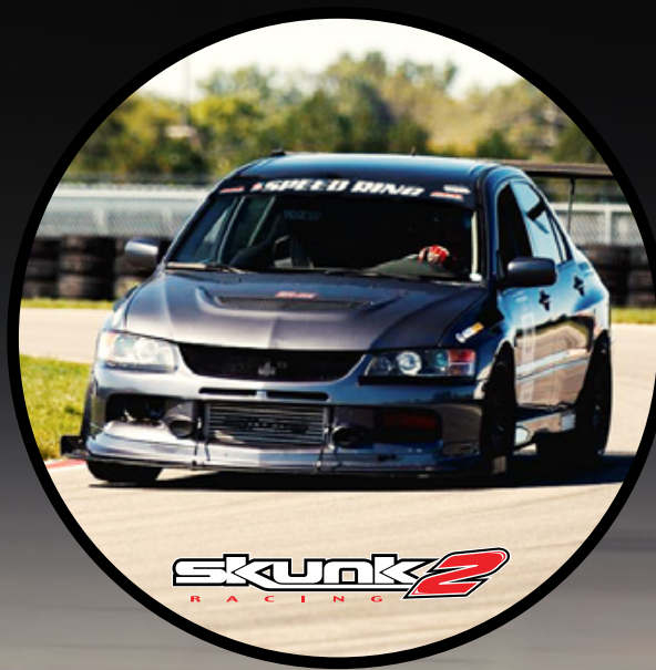
1ST PLACE STREET MODIFIED SHAWN KREBSBACH - 1:09.838